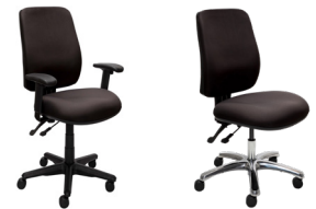
NYLON BASE With Arms